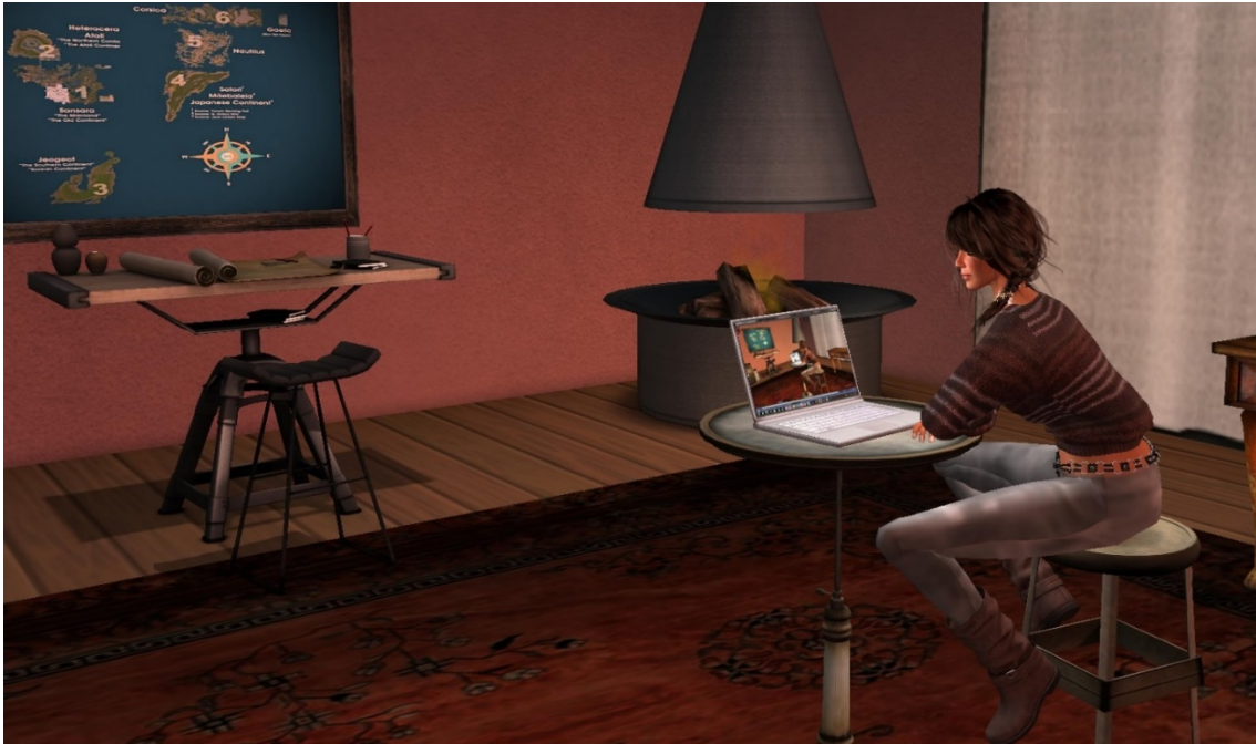
“Yordie Sands @ Blogging in Second Life 2014” by Yordie Sands (Flickr.com), CC BY-ND 2.0

While digital technologies allow us to approach traditional modes of writing in new ways – through word processing, blogging, texting, etc. – they also radically change what happens when we write. Social media, virtual environments, video games, A/V production tools, and platforms for designing websites open up new types of spaces and environments that in turn call for new writing practices. Through our multimedia and multimodal assignments, you will have an opportunity to develop traditional writing skills in ways relevant to your personal, academic, and professional interests. At the same time, we’ll explore what it means to write through web design, through audio and video production, through game design and code. This will also allow us to consider how digital environments transform our understanding of writing, persuasion, and self-expression.